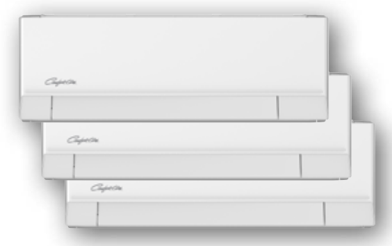
B-VMH06SV-1 to B-VMH24SV-1